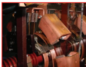
LRT-68 Selector Contacts