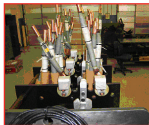
LRT-72 Reversing Switch