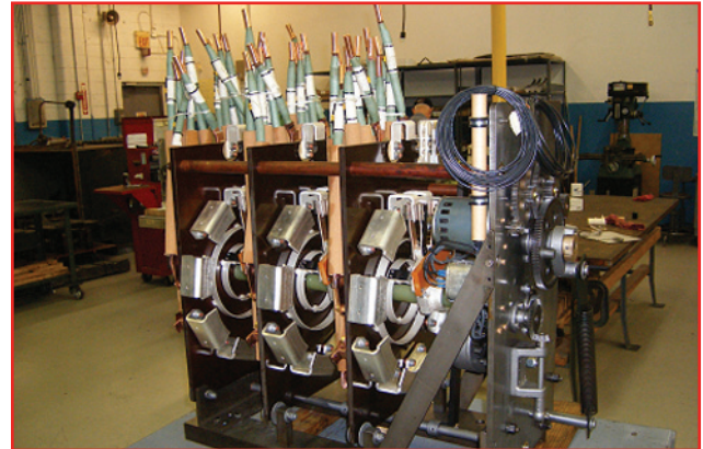
GE LRT-72 Load Tap Changer

Recognizing the demand in the electric power industry for a structured program that teaches these critical skills, we developed a comprehensive series of LTC maintenance training courses. Two of the models on which we can help are the GE LRT-68 and LRT-72.