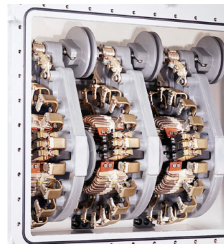
Waukesha UZD Load Tap Changer