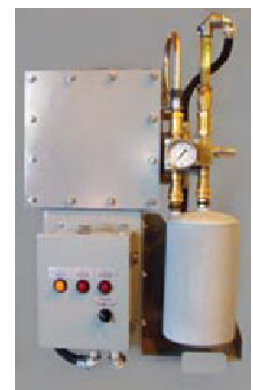
LTC Oil Filtration System