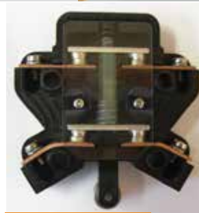
PART NO. 2000-1339