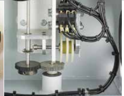
PART NO. 2000-1299