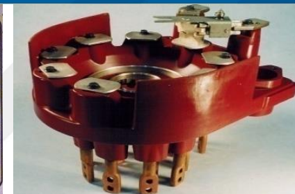
Federal Pacific TC Series