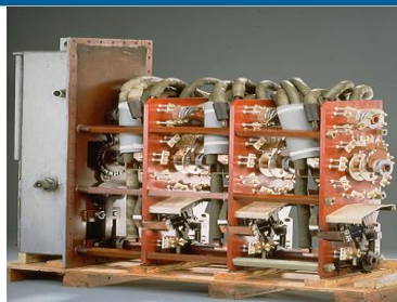
Westinghouse UTT, UTT-A, UTT-B