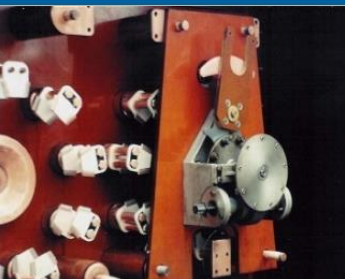
McGraw Edison 550 Series