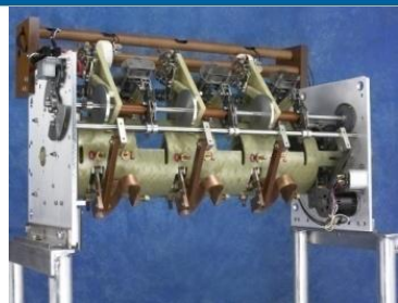
General Electric LRT-200-2